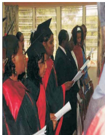
IFTS in Kenya